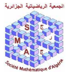
الجمعية الرياضية الجزائرية Société Mathématique d'Algérie

www.ciaem.org Contact : ciaem70@gmail.com