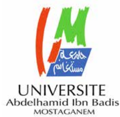
UNIVERSITE Abdelhamid Ibn Badis MOSTAGANEM