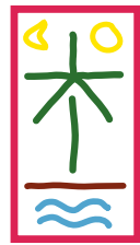
Djanatu al Arif