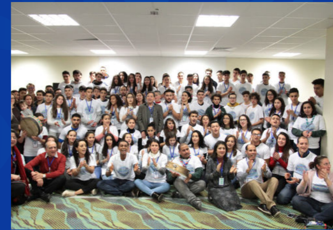
Mandelieu-la-Napoule, France 2017

In 2024, it was decided to organize the end-of-year meeting in Sarajevo, capital of Bosnia-Herzegovina, in order to discover and explore the Sufi Islam of the Balkans.