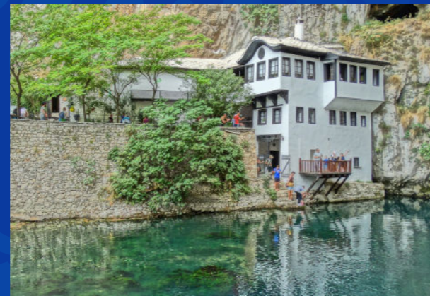
Blagaj tekke: spiritual haven hidden near the source of the Buna, emblem of Sufism in Bosnia