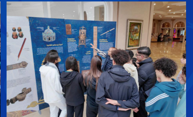
Hammamet, Tunisia 2023