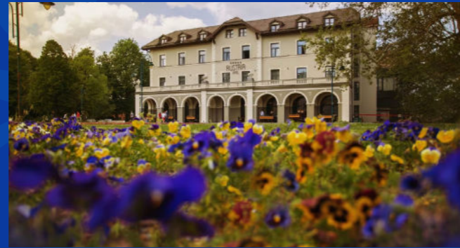
Reception for the Encounter with the Sufi Islam of the Balkans, and its various workshops