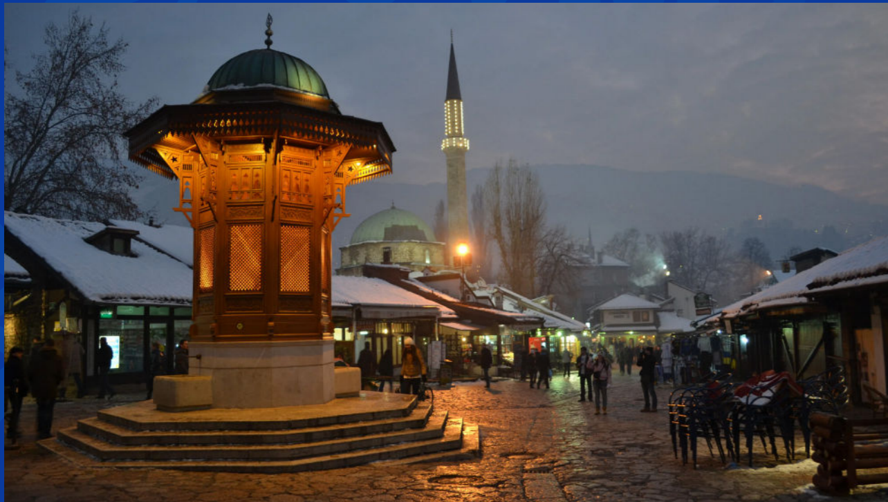
Sebilj fountain, Sarajevo: iconic monument in Sarajevo, the heart of its historical heritage