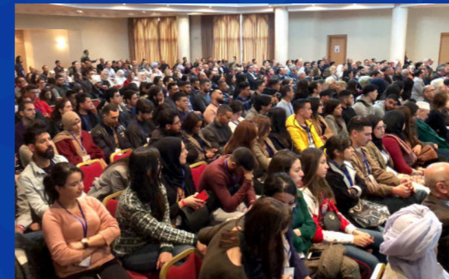
Hammamet, Tunisia 2019