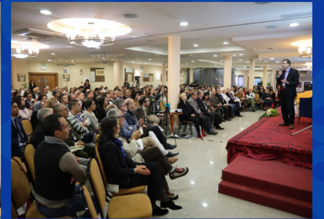
Murcia, Spain 2018