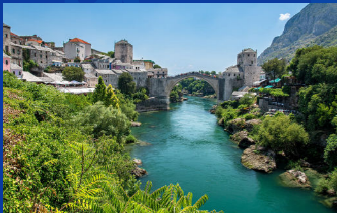
Mostar bridge: icon of the Balkans, linking culture and history over the centuries